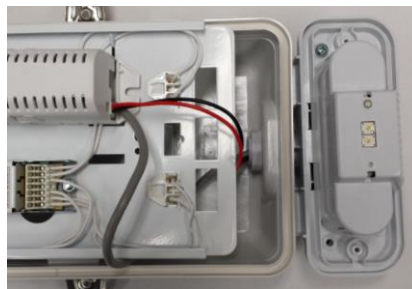
LED POD cover removed.