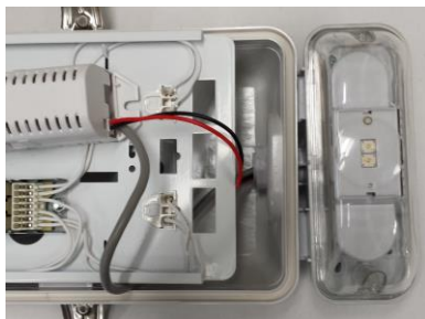
LED POD location on batten